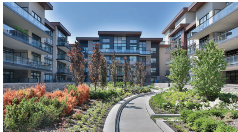
All rendering is artist's concept. Materials and specifications are subject to change. E.&O.E.