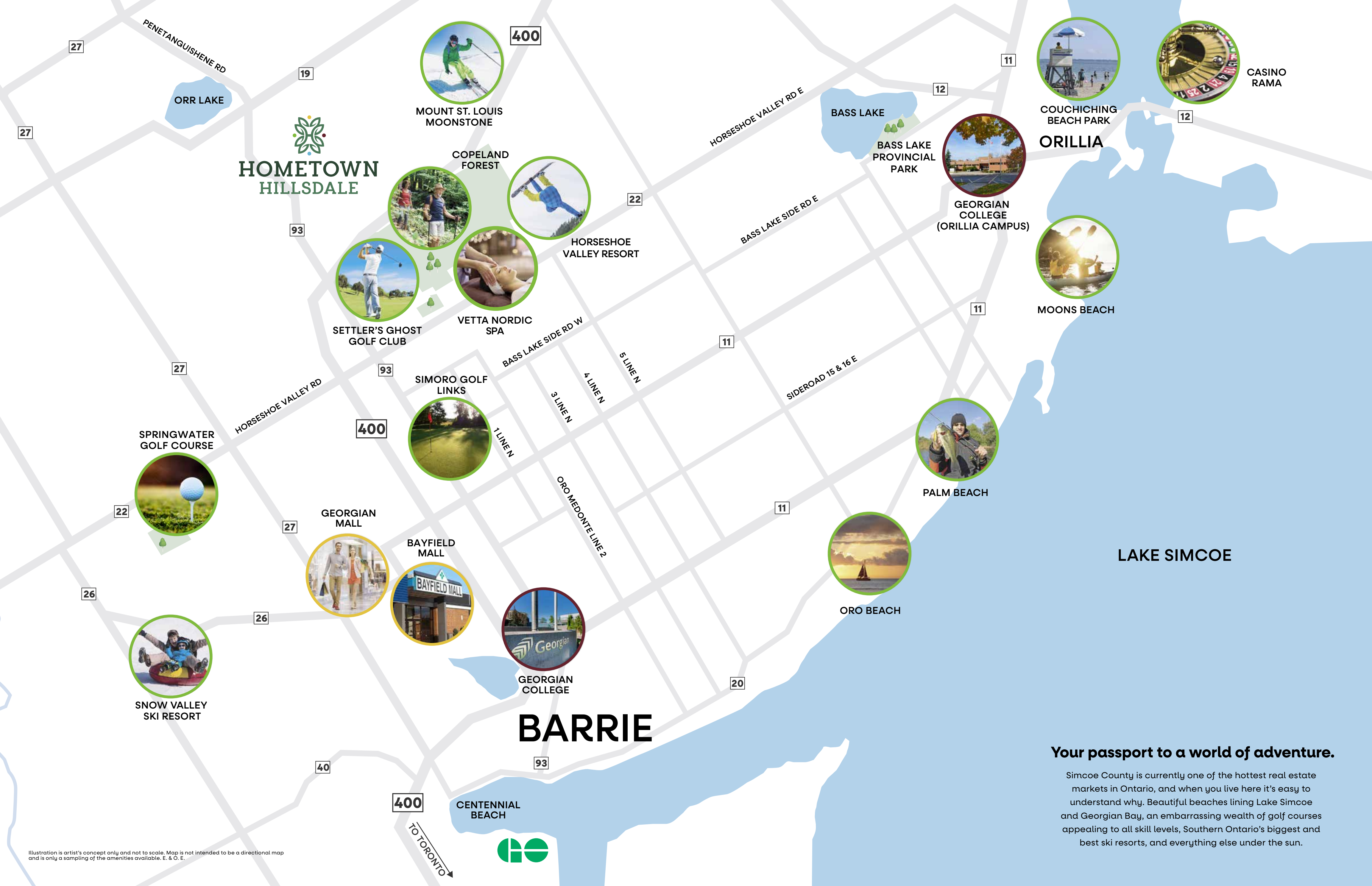
Illustration is artist's concept only and not to scale. Map is not intended to be a directional map and is only a sampling of the amenities available. E. & O. E.