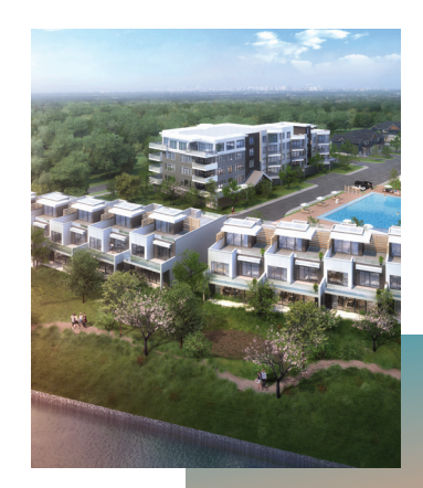
enelon Lakes Club