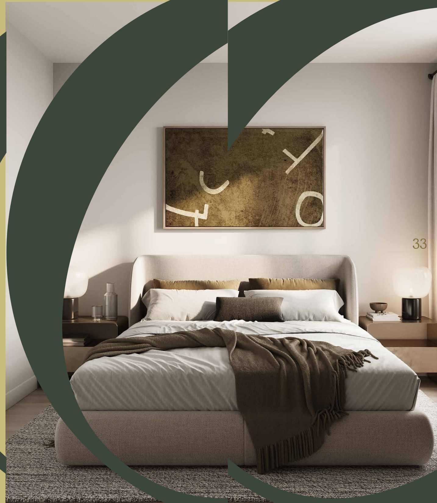
Illustration is artist's concept. E.&O.E.

Commanding 9' or 10' ceilings that complement luxurious quartz kitchen countertops, and stainless-steel appliances add a sleek, classic look to the open concept living and dining space.