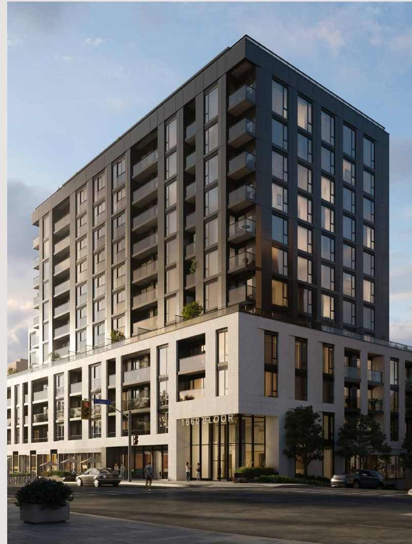
- Westbend, Toronto