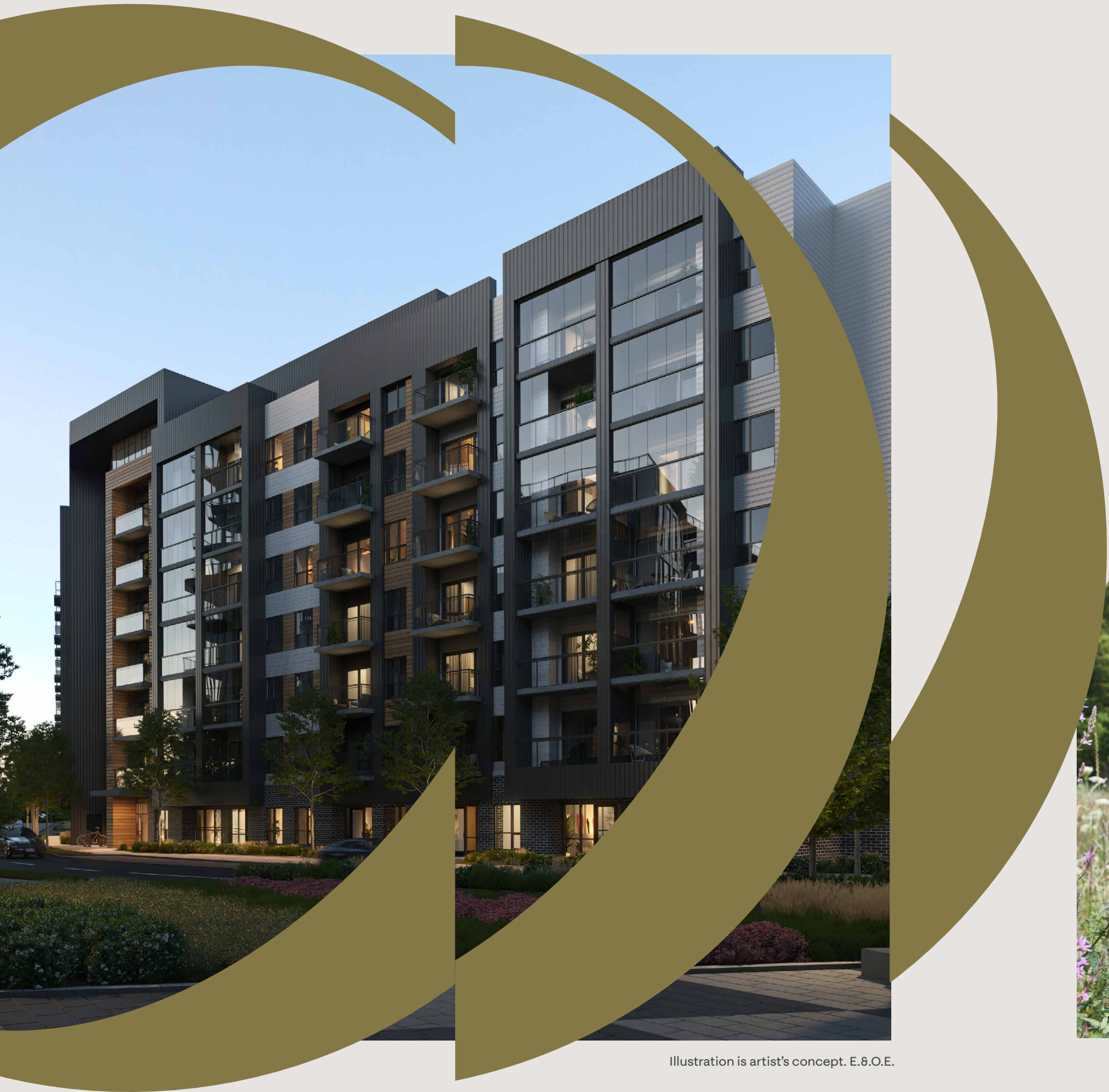
Illustration is artist's concept. E.8.O.E.