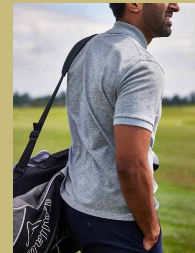
Illustration is artist's concept. E.&O.E.