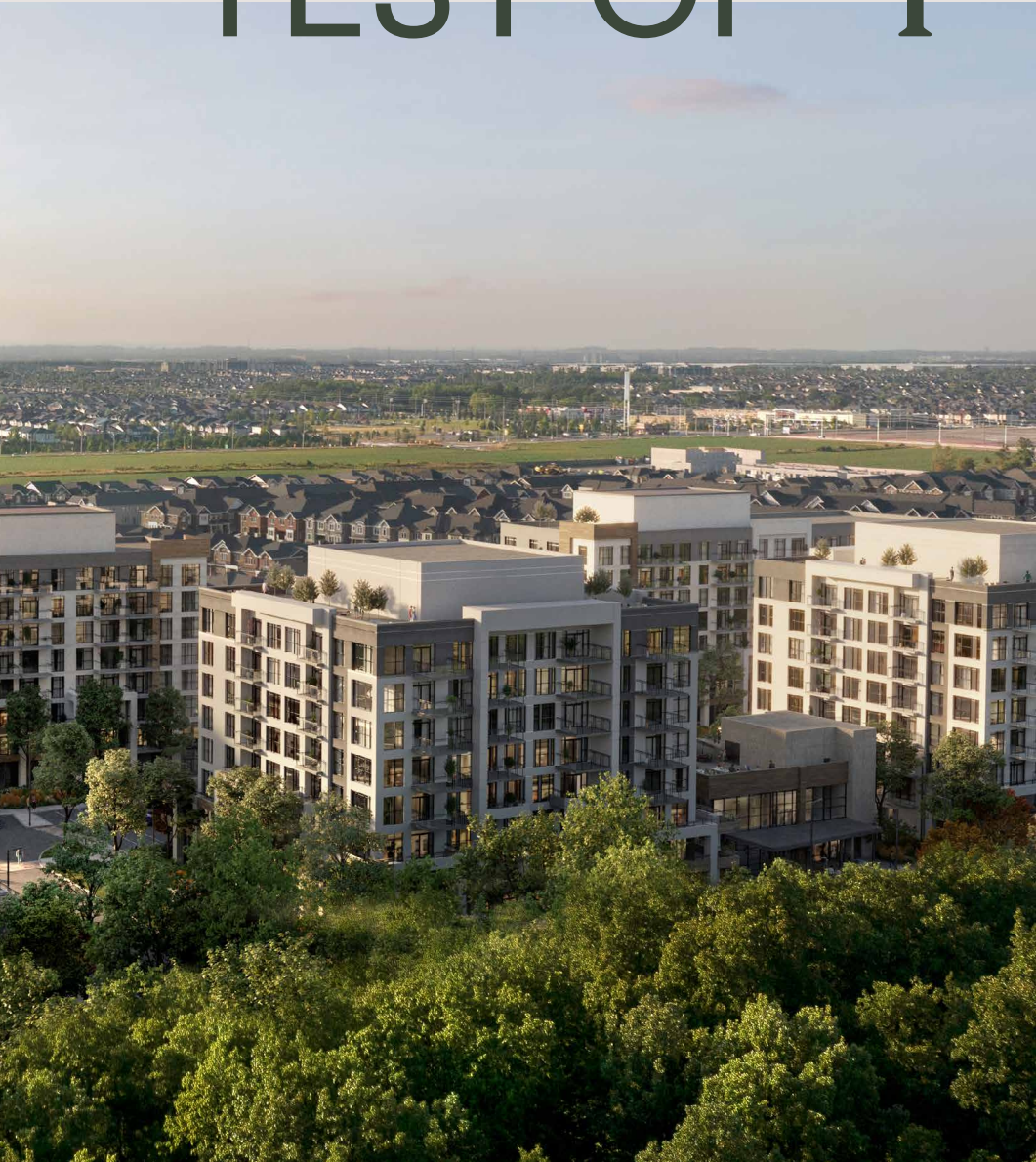
- Mile & Creek, Milton