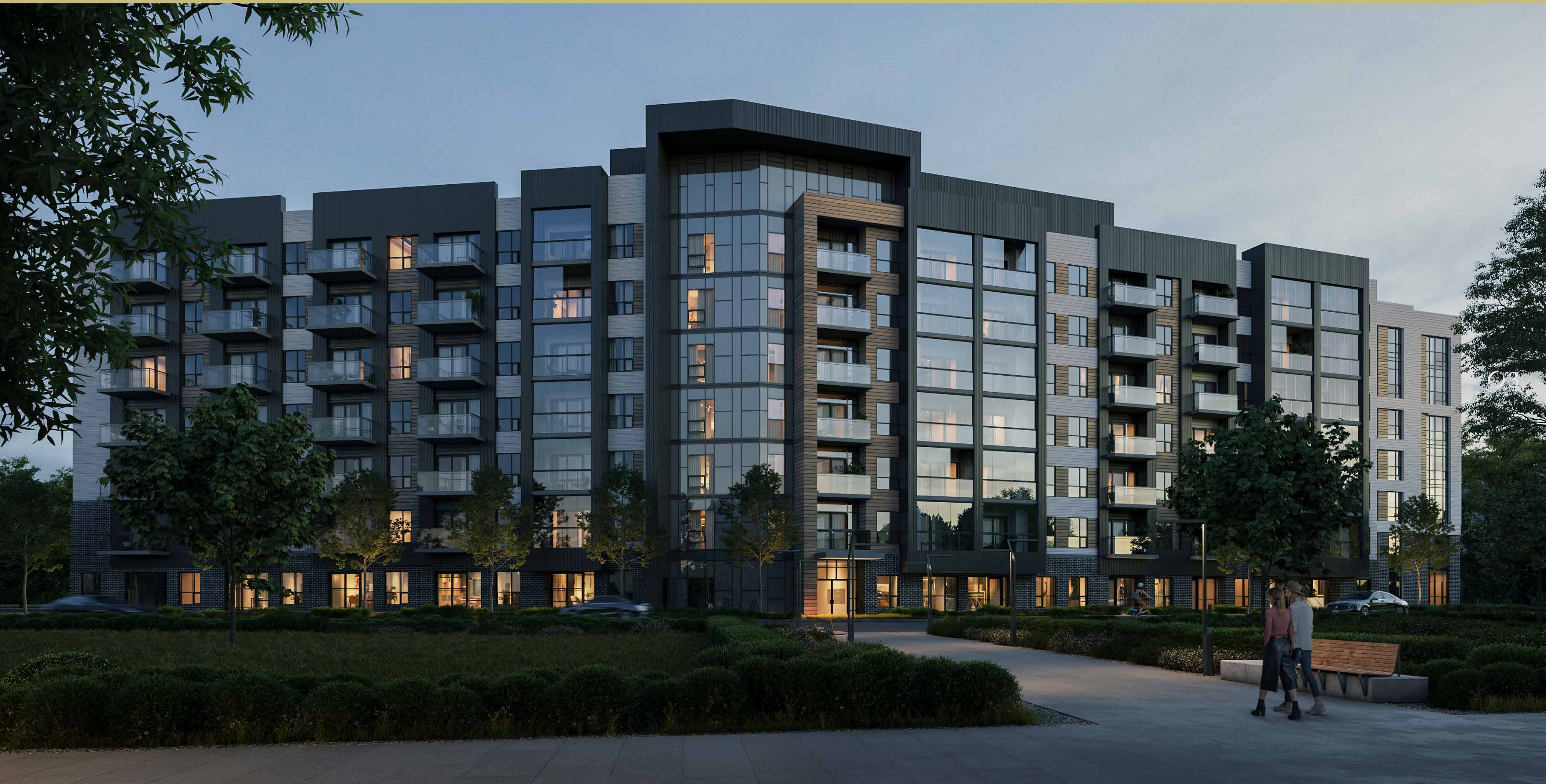
Illustration is artist's concept. E.&O.E.